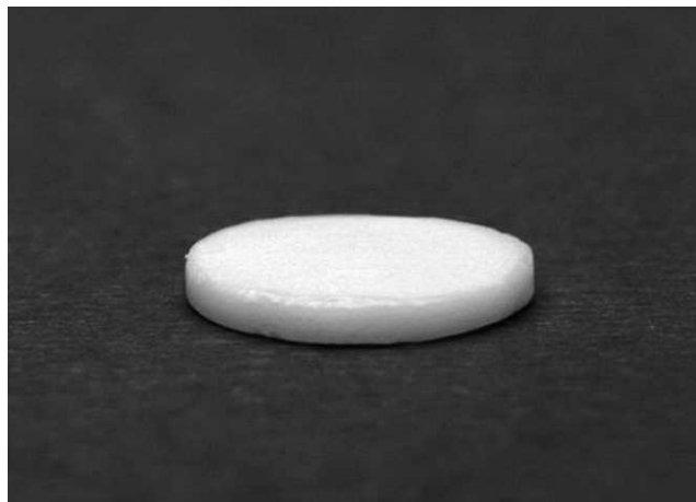
Figure 1. Ceramic disk 1.5 mm thick and 12 mm in diameter.

NRPA was provided as pellets or ingots with 1 cm diameter and 9 mm thickness. Discs of 1.0- and 1.5-mm thickness were fabricated using lost wax and pressing techniques with two firing cycles at 890°C-900°C (EP 600, Ivoclar Vivadent). Etching with 5%