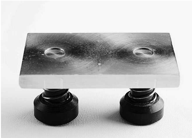
Figure 2. Custom made stainless steel mold.

hydrofluoric acid for four minutes was done to produce a rough surface for adhesive bonding.