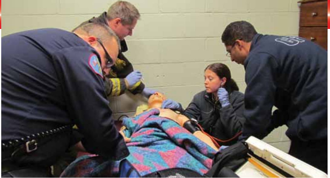
ALS fire and ALS ambulance crews work together to assess a patient—one of the Simulation Training Center's new high-fidelity manikins.

arrest runs prior to the ICCA course with runs handled after the launch of the class. This research focuses on comparing the amount of time CFD engine companies spend on scene, proper defibrillation technique (timing and number of shocks delivered), time spent off the chest of the patient, use of their Lifepak monitor/defibrillator and the patient's ultimate outcome. The data will be compiled and presented in a future paper.