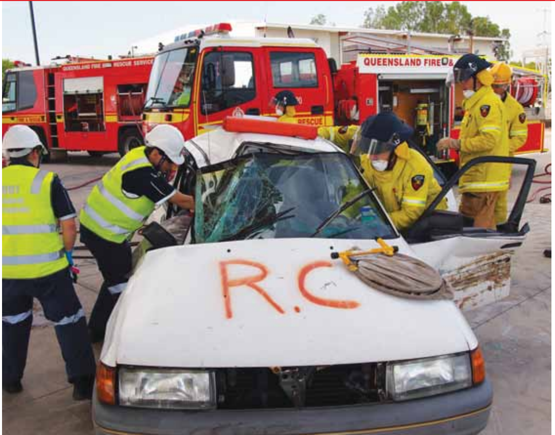
Firefighter and paramedics work together to assess and treat a simulated trauma victim.

dency to be tutor lead and constructed around a practical/ laboratory type session.