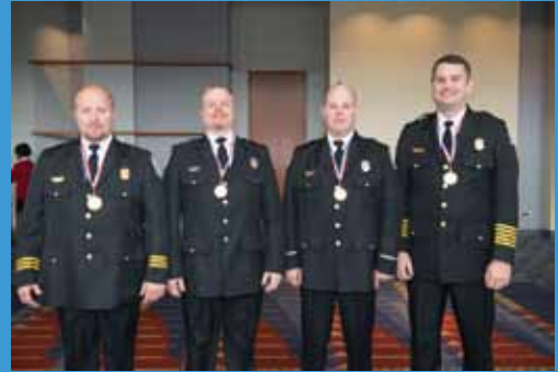
The 2014 Gold Medal Team, Cumberland County (N.C.) EMS