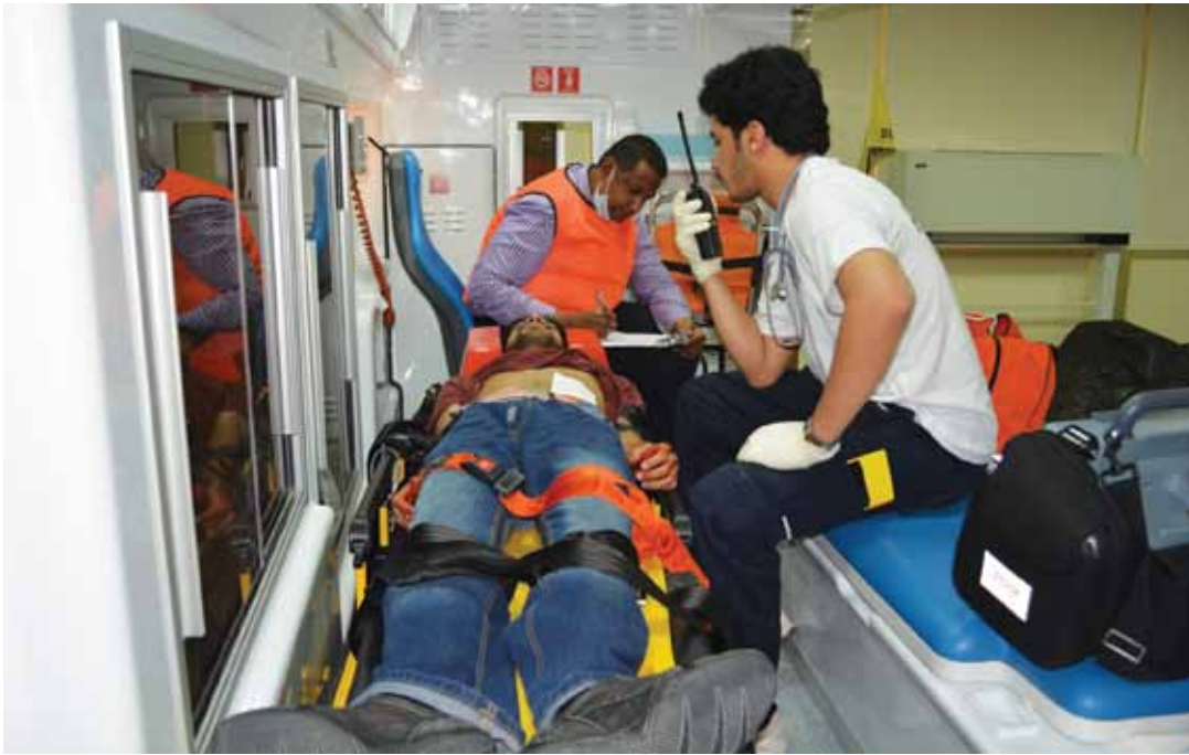
Ambulance simulators were designated as transporting ambulances.

ence, personal experience and recommendations for future MCI trainings.