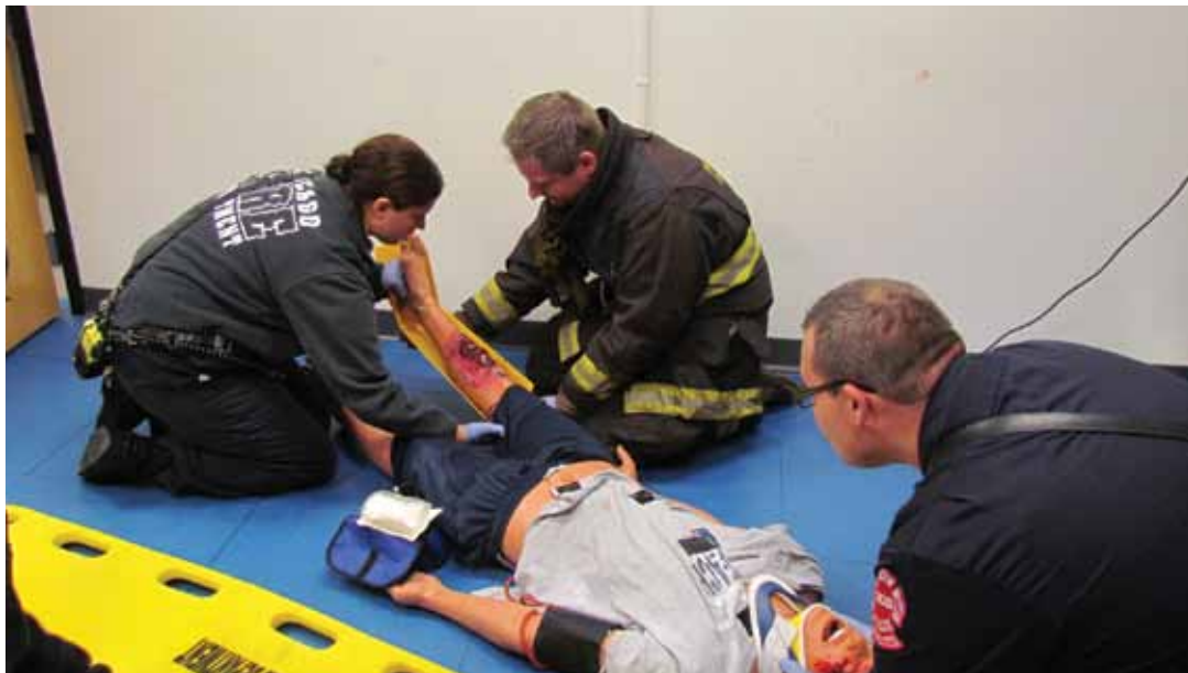
Firefighter and paramedics work together to assess and treat a simulated trauma victim.

The CFD STC has started preliminary data collection through the SafetyPAD EMS information management system to compare cardiac