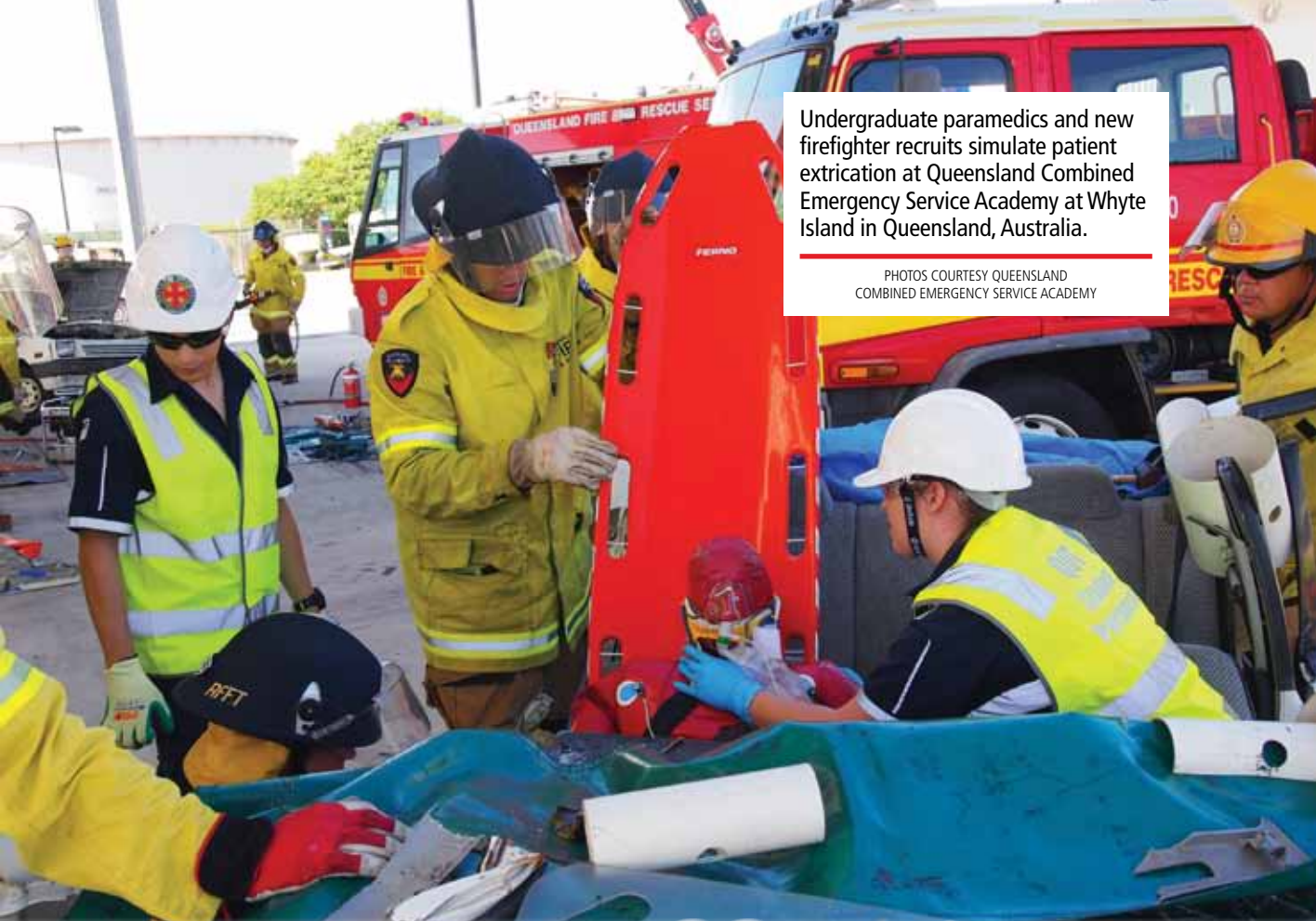
Undergraduate paramedics and new firefighter recruits simulate patient extrication at Queensland Combined Emergency Service Academy at Whyte Island in Queensland, Australia.