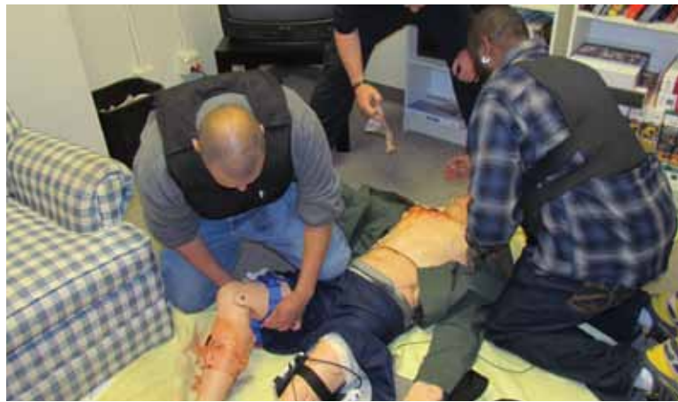
Law enforcement personnel apply a tourniquet to an injured simulated officer part of Law Enforcement Medical and Rescue Training.

They're also given the opportunity to go on ride alongs with CFD ambulance crews to get first-hand experience in the prehospital atmosphere and have the option to work on CFD STC research projects. This program provides a unique