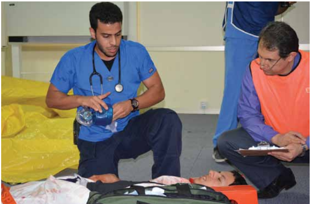
Each patient had an assigned evaluator who scored how each patient was triaged and treated.