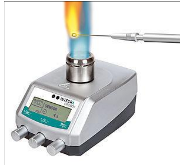
Bunsen burners , flames