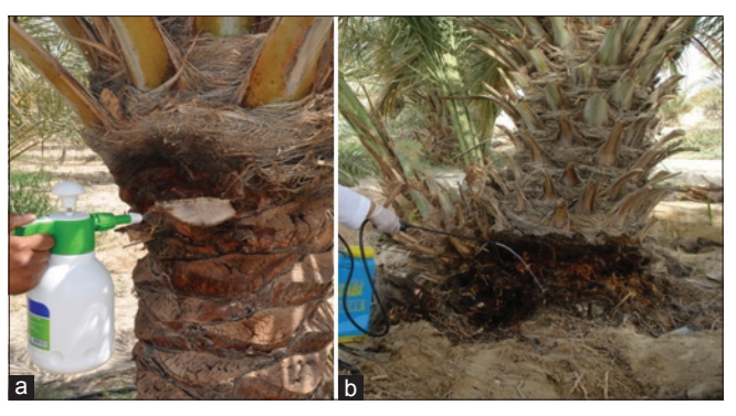
Fig 3. Protect fresh injuries on the palm with insecticide immediately after frond shaving (a) and offshoot removal (b)

Insecticide treatments of date plantations in endemic hot spots by taking up preventive spray/shower applications are practiced to restrict the spread of R. ferrugineus . Protecting fresh injuries from invading female weevils through insecticide application (Fig. 3) to prevent egg laying has been recommended in the past (Abraham et al., 1998). Curative insecticide treatments of palms in the early stage of attack through stem injection technique are known to cure such palms. Initially organophosphate (trichlorphon) and carbamate (carbaryl) based insecticides were used both in preventive and curative applications based on experiences on coconut in South Asia (Abraham et al., 1975; Kurian and Mathen, 1971; Faleiro 2006).