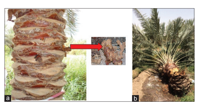
Fig 1. Red palm weevil infested date palms in the early (a) and advanced (b) stages of attack

R. ferrugineus is reported to attack 40 palm species worldwide (Anonymous 2013), with the canary island date palm, Phoenix canariensis, date palm, P. dactylifera and coconut palm, Cocos nucifera being among the most widely preferred hosts (Faleiro et al., 2014). According to Abraham et al 1998 a R. ferrugineus infested date palm exhibits one or more of the following symptoms viz., oozing of brownish fluid together with palm tissue excreted by feeding grubs which has a typical fermented odour, drying of infested offshoots, tunneling of palm tissue by grubs, presence of adults and pupae at the base of fronds, pupae around an infested palm, drying of outer leaves and fruit bunches and toppling of the trunk in case of very severe and extensive tissue damage (Fig. 1). R. ferrugineus population is highly aggregated in nature which results in infestations occurring in clusters (Faleiro 2006), often by invading adults that fly