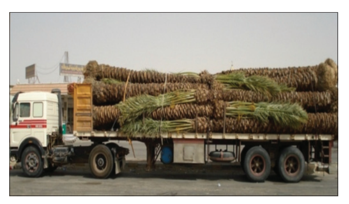
Fig 4. Transportation of date palms for ornamental gardening: A potential RPW quarantine risk

Undoubtedly R. ferrugineus is among the world's most invasive pest species of palms that has rapidly expanded its geographic range during the last three decades especially after it gained foot hold on date palm in the Middle-East during the mid-1990s. Adopting R. ferrugineus mitigating date palm agro-techniques from varietal selection, palm density in the field, irrigation method to regulate in-groove humidity, identifying and eliminating hidden breeding sites are essential. Besides, trapping adult weevils using food baited pheromone traps to monitor and mass trap adult weevils, inspection of palms to detect infestations before adults emerge is crucial to ensure success of the R. ferrugineus-IPM programme. The importance of regular inspection of date palm grooves in the susceptible age of less than 20 years to manually and visually detect infestation has been overlooked by pest managers and needs to be emphasised as an important component of the current R. ferrugineus-IPM strategy. In this context,