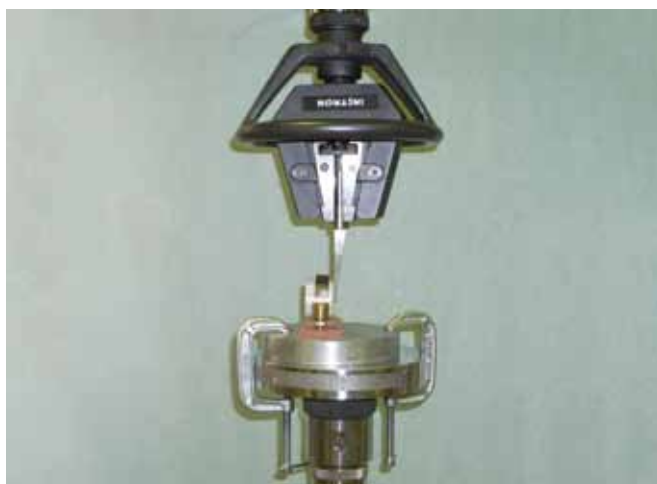
Fig. 1: Shear bond strength test specimens in the universal testing machine

Inc., San Diego, CA USA). Differences between the four study groups were determined with one-way analysis of variance (ANOVA). When an overall ANOVA showed statistical significance, post hoc testing (Tukey-Kramer multiple comparisons test) was performed to explore the differences between any two groups. p -values < 0.05 were considered significant.