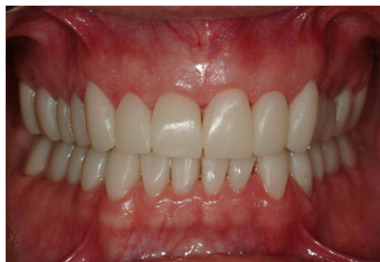
Fig 4: Frontal view photograph of mandibular and maxillary teeth provisional crowns