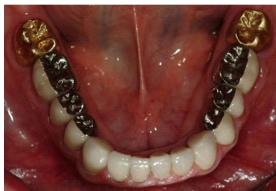
Fig 6: Intraoral Mandibular occlusal view photograph of the final crowns adequate ferrule effect, crown lengthening surgery was performed.

A diagnostic wax-up was done to plan the anticipated occlusion and aesthetic outcome. Provisional crowns for the teeth were manufactured according to the diagnostic wax-up and index (Fig 3). Provisional crowns and the Fixed Dental Prosthesis (FDPs) were fabricated using autopolymerized acrylic resin ALIKE™ (GC 3737 W. 127th Street Alsip, IL 60803, USA).