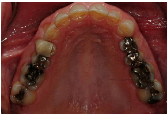
Fig 2: Intraoral maxillary occlusal view photograph showing enamel erosion on incisal and palatal surfaces