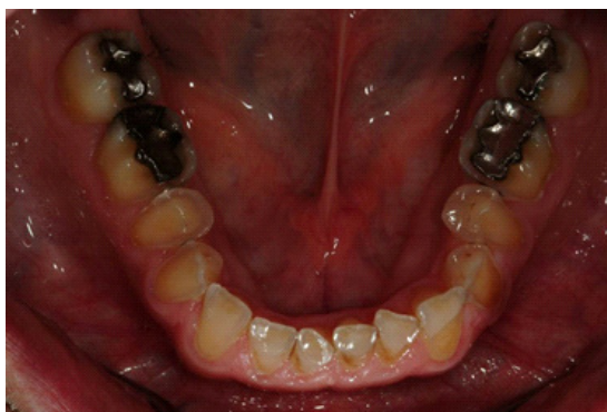
Fig 1: Intraoral mandibular occlusal view photograph showing enamel erosion on the occlusal and buccal surface

Before starting the prostheses stage; all carious teeth (including recurrent caries) were restored with Filtek™ Supreme Ultra Universal Restorative (3M Center, St. Paul, MN 55144, USA). All abutment teeth were thoroughly examined. As some of the teeth did not have enough remaining coronal tooth structure for