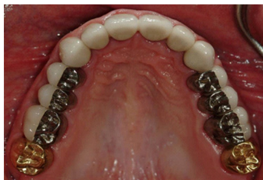
Fig 5: Intraoral Maxillary occlusal view photograph of the final crowns