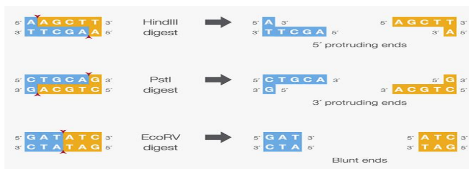
Figure.1. Generation of blunt and sticky ends fragments by different RE.

A fragment of DNA produced by a pair of adjacent cuts is called a RESTRICTION FRAGMENT. Restriction enzymes can generate two different types of cuts ( Figure.1 ) depending on whether they cut both strands at the center (Blunt end) of the recognition sequence or each strand closer to one end of the recognition sequence (Sticky end). The latter (sticky ends) are more cohesive compared to blunt ends, which have no nucleotide overhangs. Both are useful in molecular genetics and can be used for join DNA fragments.