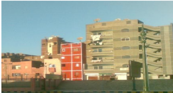
c. El Gaish street.