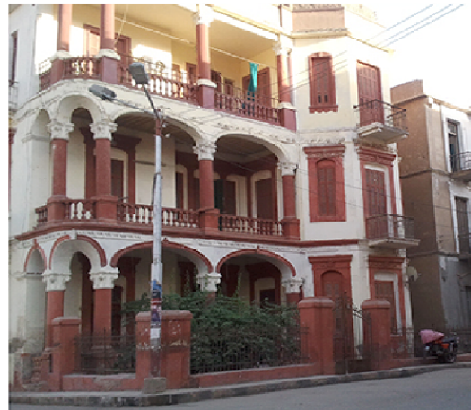
b. Old residential house in Mohamed Ali Makarem st.