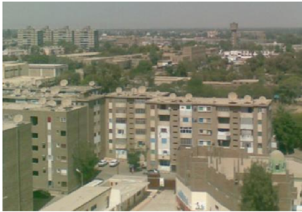
a. Ezbet Elsegn area