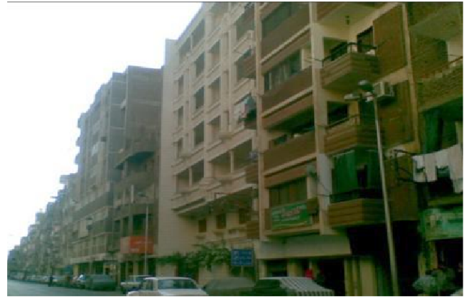
b. Mahmoud Rashwan Street