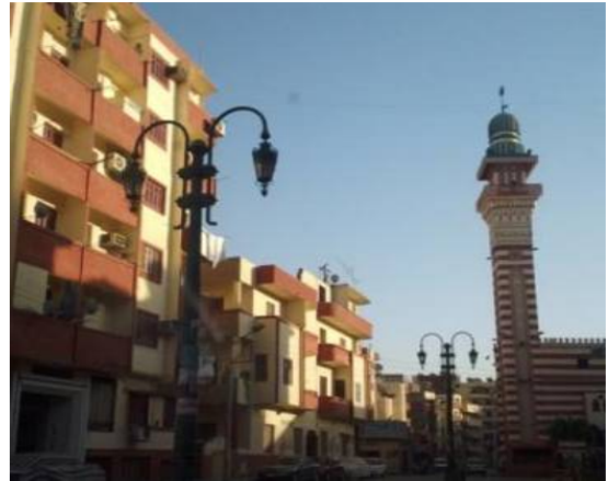
Fig.6: Sity Street : the right part is a mousque – the left part is residential buildings.