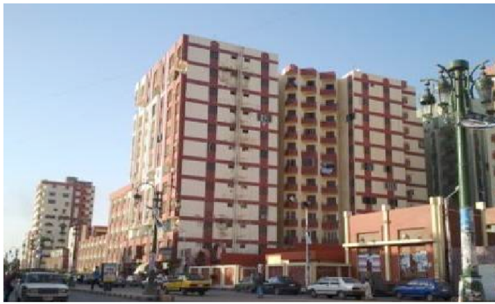
Fig.5: El-Gamaa street: the frontal part of the image is a partial sanitary station - the higher buildings are residential buildings.