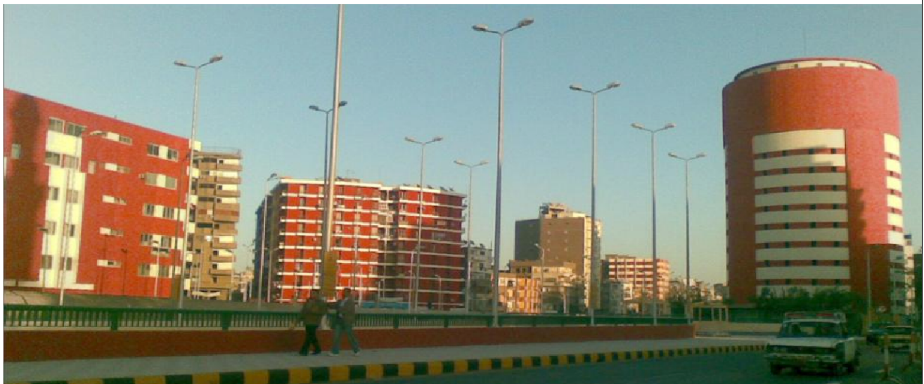
Fig.4: Yousry Ragheb street: the right part of the image is a water tank tower – the middle part is a residential building – the left part is an office building. All had been painted by the same colors ( dark red and white yellow).