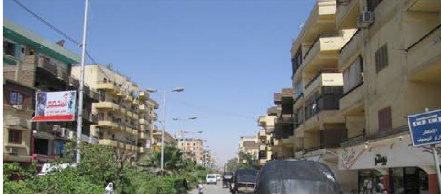
a. Luxor city facades painted in light yellow.