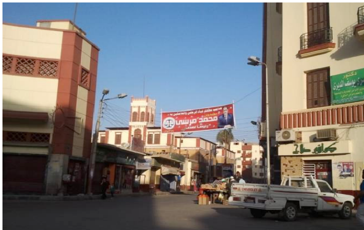
a. Cheicoril square.