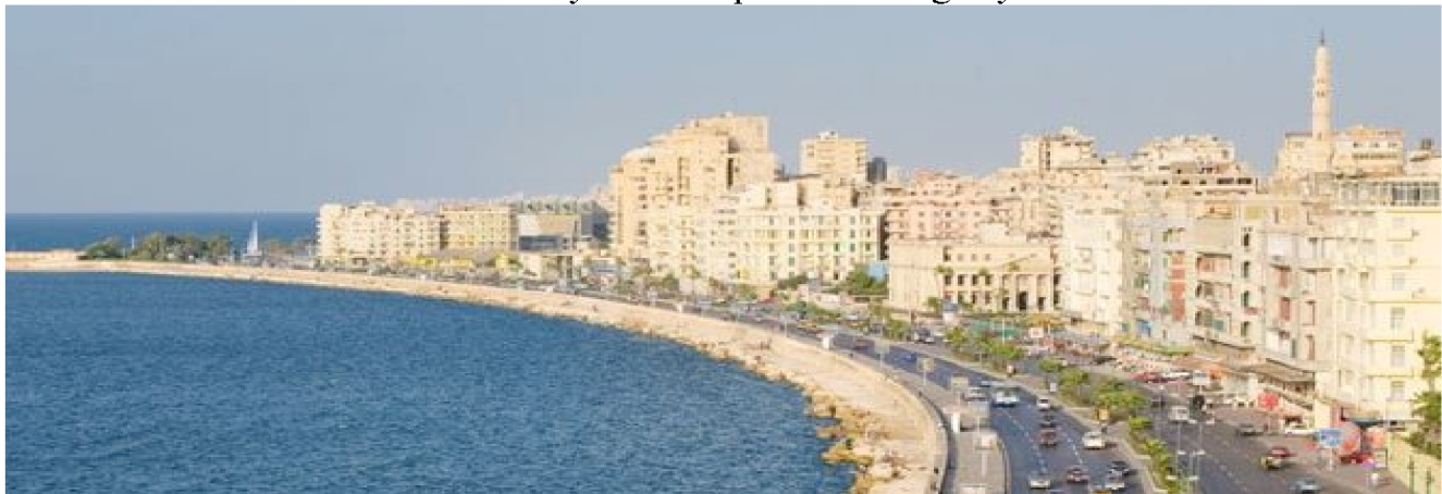
b. Alexandria city facades painted in white.