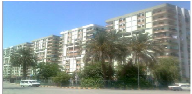
d. Al-Azhar street