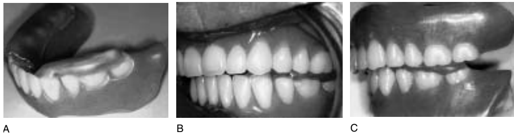
Fig. 12.3 Precentric check record. A Softened wax on the posterior mandibular teeth. B Patient has closed into the wax in the retruded arc of closure. Closing has stopped before the artificial teeth contact. C Precentric record removed from the mouth.