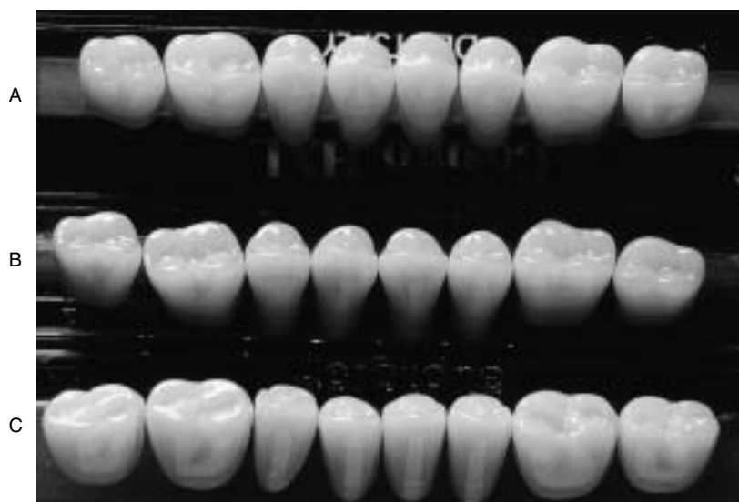
Fig. 12.2 Artificial posterior teeth. A anatomical teeth; B 10° cusps; C zero degree teeth.