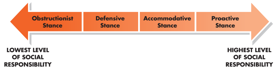
Figure 2.5 Spectrum of Approaches to Corporate Social Responsibility