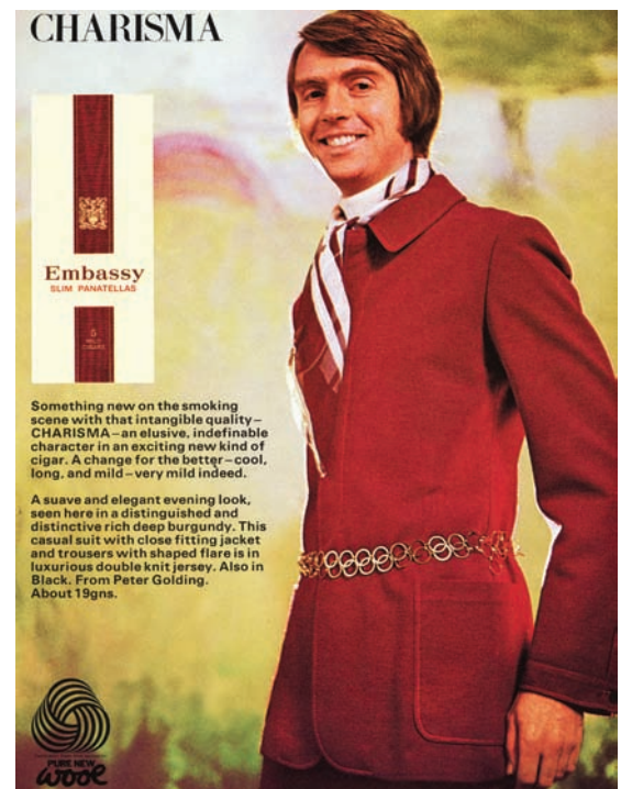
This magazine ad for cigarettes is legal in India but not in the United States.

Another issue concerns advertising that some consumers consider morally objectionable—for products such as underwear, condoms, alcohol, tobacco products, and firearms. Laws regulate some of this advertising (for instance, tobacco cannot be promoted in television commercials but can be featured in print ads in magazines), and many advertisers use common sense and discretion in their promotions. But some companies, such as Calvin Klein and Victoria's Secret, have come under fire for being overly explicit in their advertising.