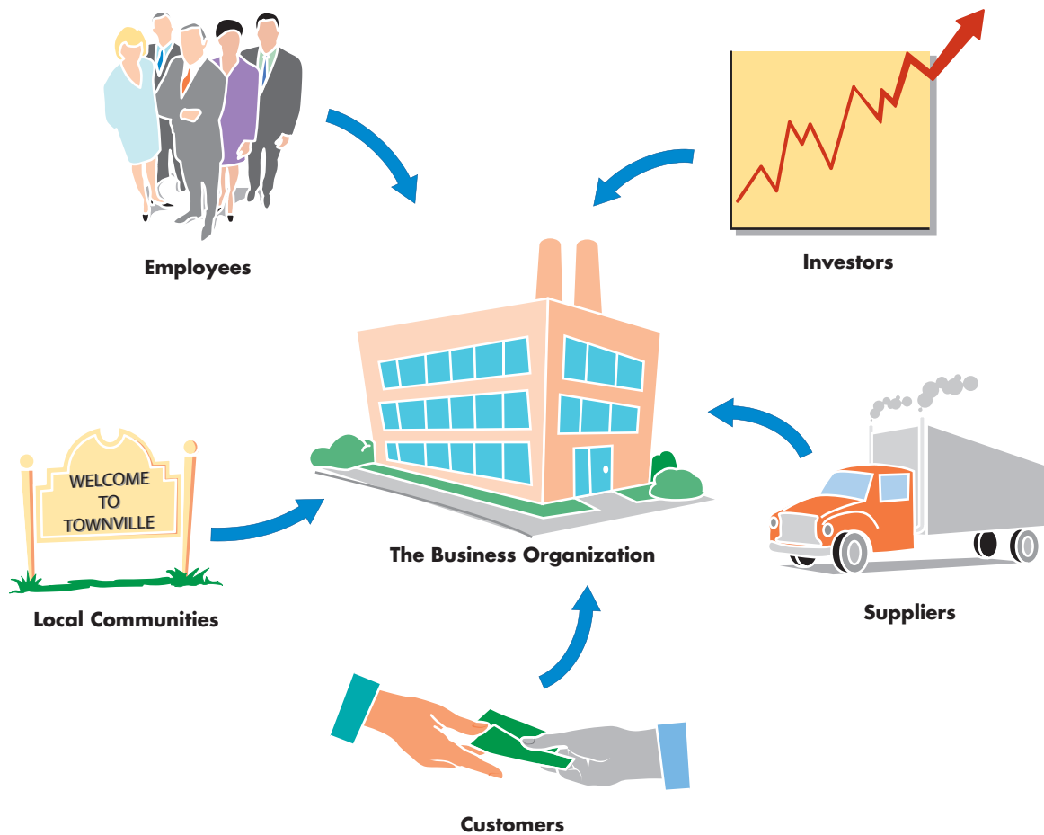
Figure 2.3 Major Corporate Stakeholders