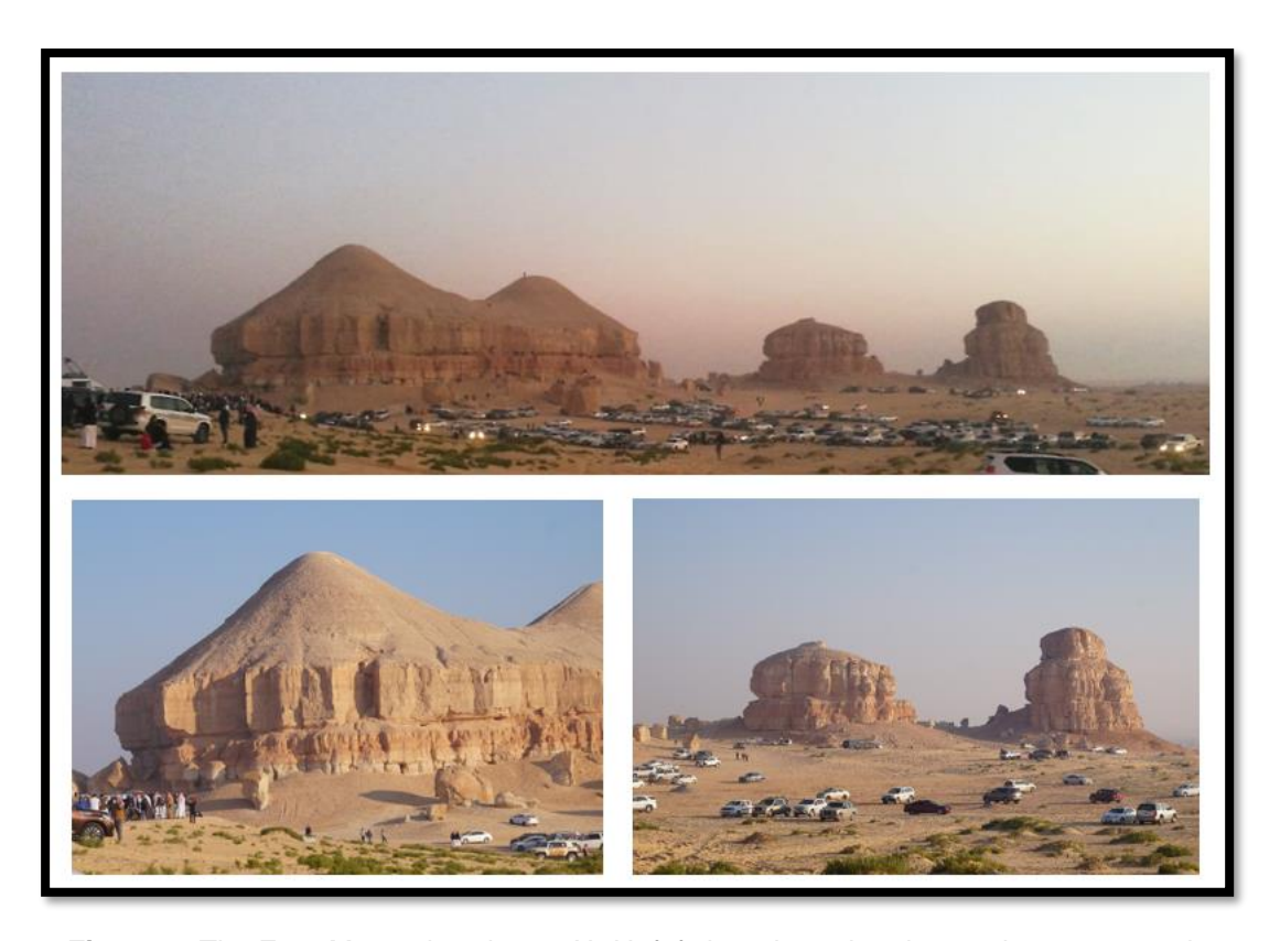
Figure 1: The Four-Mountains site, at AL-Hofuf city, where the observations were made.

For a better follow-up of the event, our observations were made at Four-Mountains area, Jabal Al-Arba'a in arabic, along the central main line of the eclipse track, situated on the road leading to Qatar country (See the site images in Fig. 1).