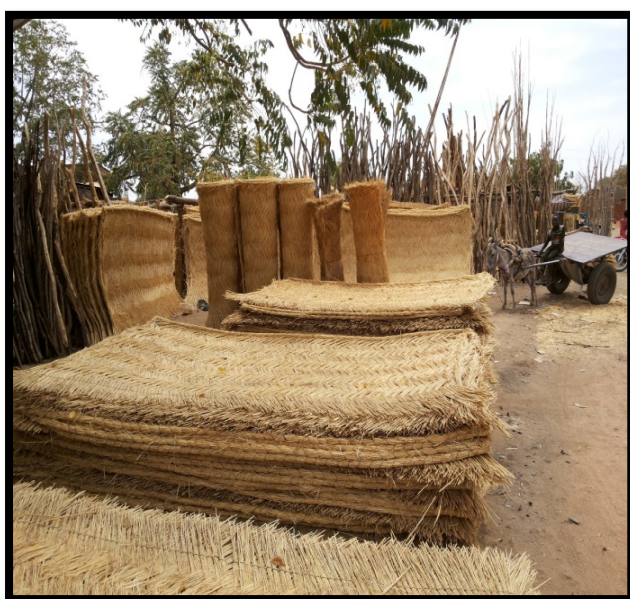
Plates 2. Local building materials trading at Dallanj town market

As shown in Table 7 a one-way analysis of variance (ANOVA) showed that respondent's occupations are significantly affect the uses of forests for the purposes of fuel wood, building materials, grazing, charcoal, trees products and entertainment (F= 8.400, 8.025, 5.180, 13.420, 2.790, 2.663 respectively, a = 0.05). These findings indicate that the respondents who work in occupations related to rural areas and natural resources (e.g. farmers, livestock breeders and wage laborers) are more widely use the forest's products. Table 8 also indicates that the respondent's occupations did not significantly affect the forest's uses for of hunting, furniture and beekeeping (F= 1.916, 1.449, 1.426 respectively, a = 0.05).