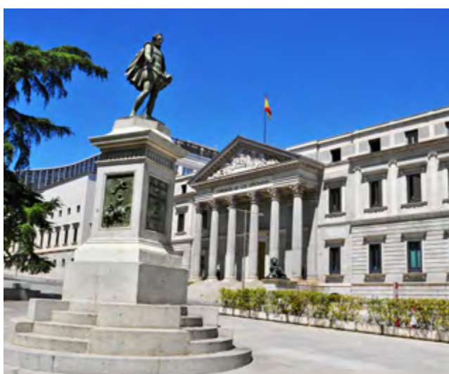
Below: Congress of Deputies in Madrid, Spain.

In addition, Turespaña appears to be responding positively to industry needs and demands. The Plan Nacional proposes a set of actions to streamline