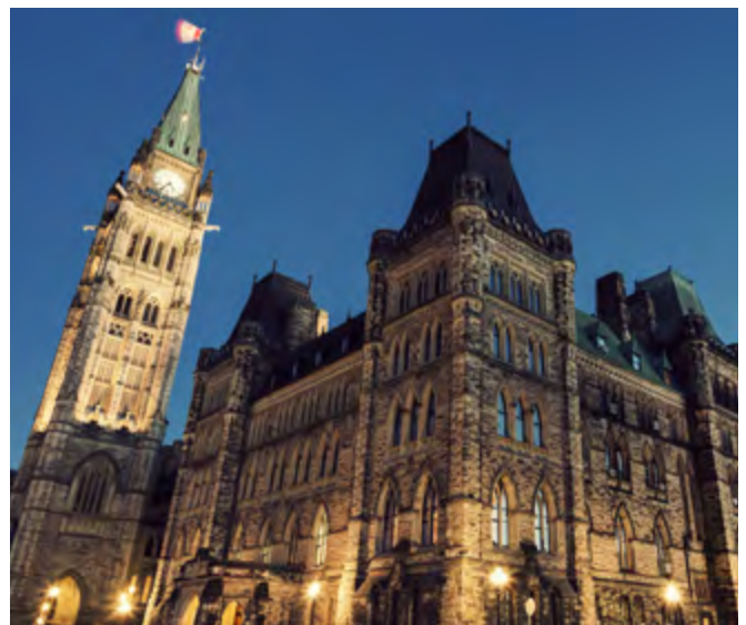
Right: Canada Parliament. Ottawa, Ontario, Canada.

Nevertheless, to stay a world leader, Canada needs to beef up its marketing and promotion, curb airline and airport fees and invest in much needed infrastructure expansion, particularly in airports.