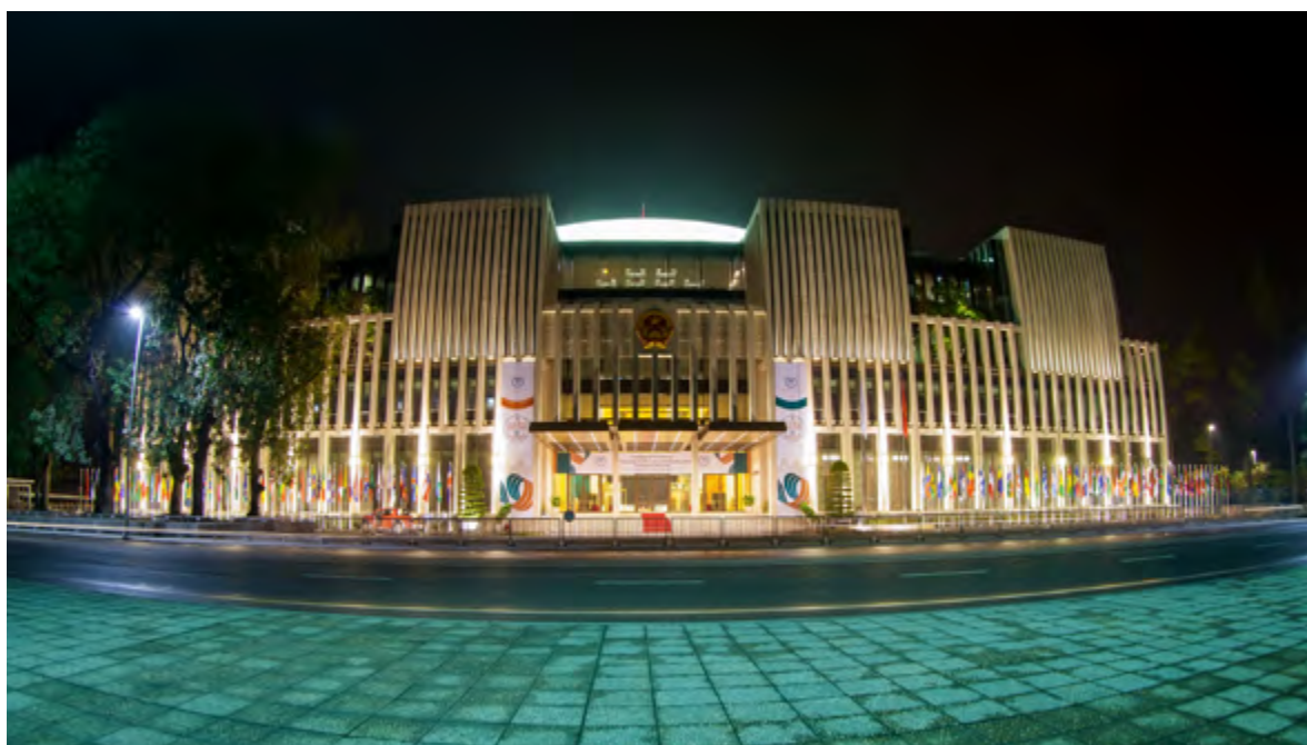
Below: Parliament House in Hanoi, Vietnam.