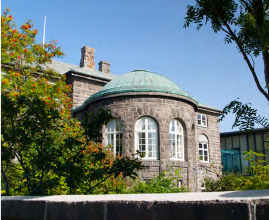
Above: Icelandic Parliament Building, Alþingishús, Reykjavík.

This is a unique posturing for Travel & Tourism in the fabric of Iceland's brand image and should serve as an inspiration for other countries.