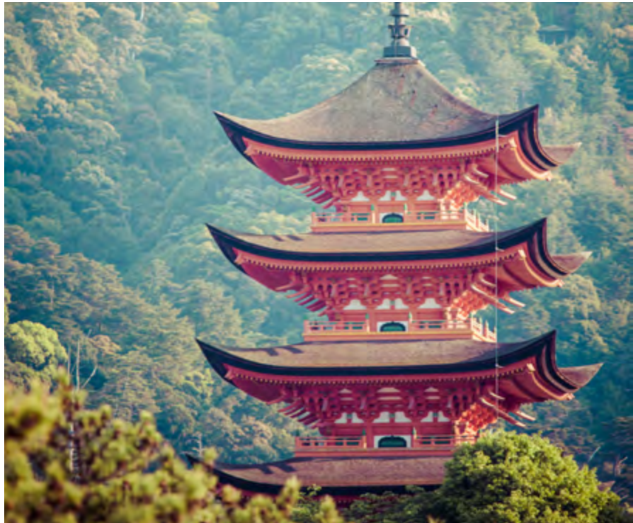
Right: Five-storey pagoda in Miyajima, Japan.

that still require visas to enter Japan, and to open up the country to low-cost airlines (after resisting for a number of years). These steps have all been taken as a result of the JTA's increased consultation with other ministries and to improved relations with the private sector.