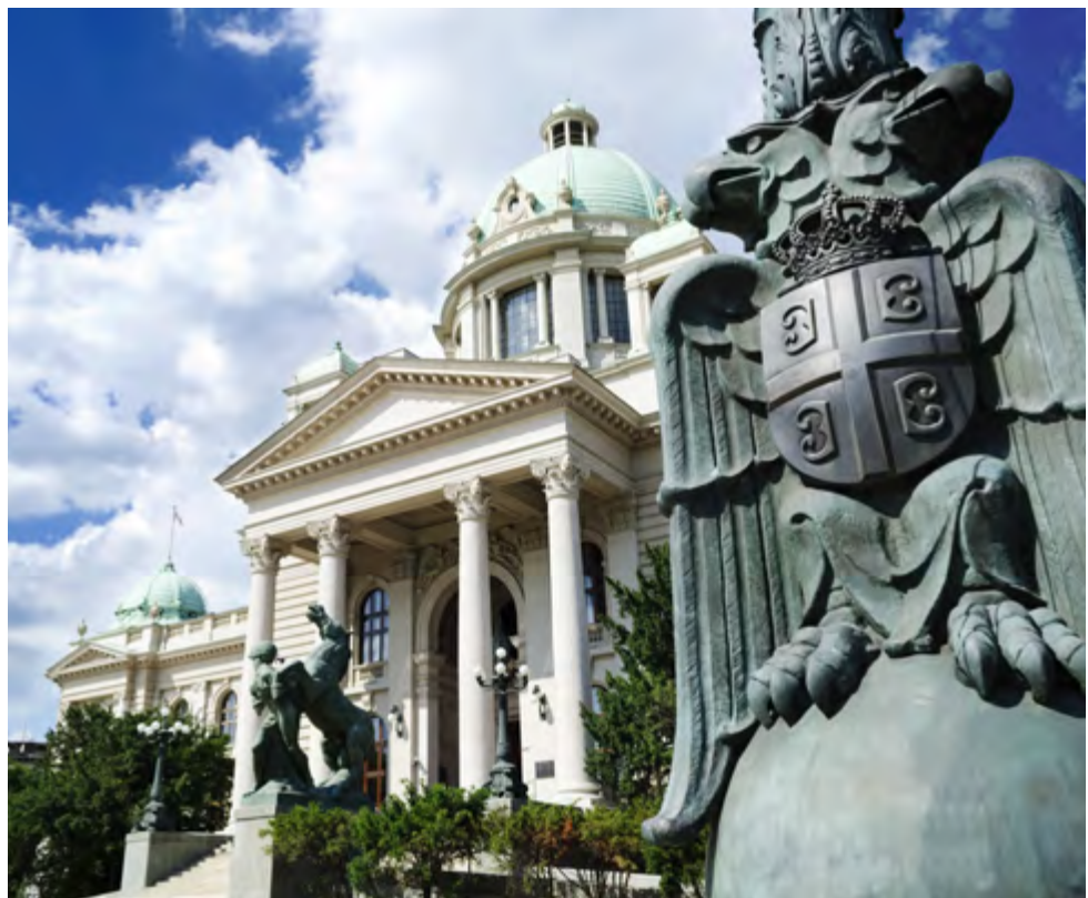
Below: National Assembly of the Republic of Serbia, in Belgrade, Serbia.