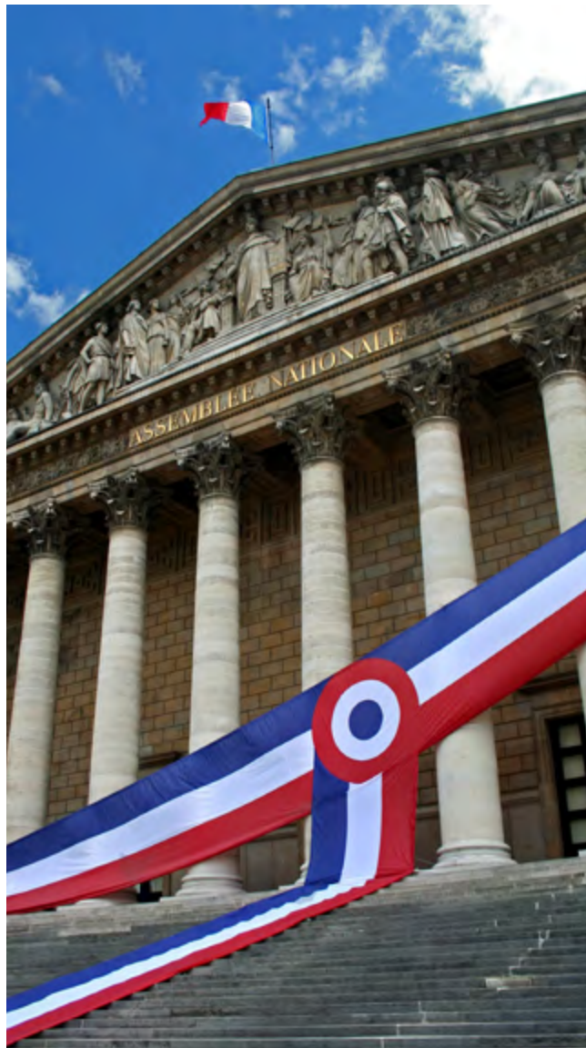
Right: Assemblée Nationale, Paris, France.

The creation of the Tourism Promotion Council, chaired by the high-level Minister of Foreign Affairs, and which is reportedly meeting regularly (last meeting in July 2015) and on a frequent basis, may represent a new turnaround in the government's commitment to Travel & Tourism.