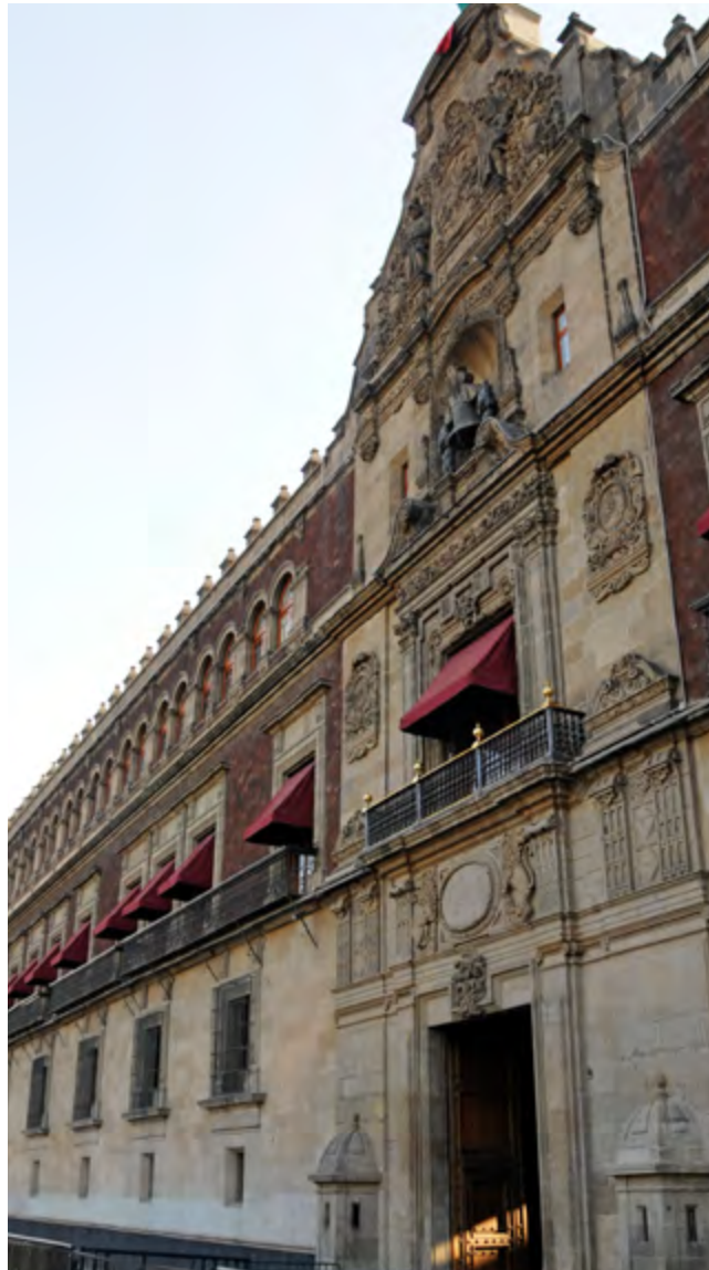
Below: Palacio Nacional in Mexico City, Mexico.

The newly appointed Secretary of Tourism, Enrique de la Madrid Cordero, will focus on the economic value of Travel & Tourism by examining the supply-chain benefits to the local community. His accomplished financial leadership background as General Director of Financiera Rural and, most recently, as General Director of the Banco Nacional de Comercio Exterior Bancomext, will add a serious dynamic to the policy deliberations for the sector.