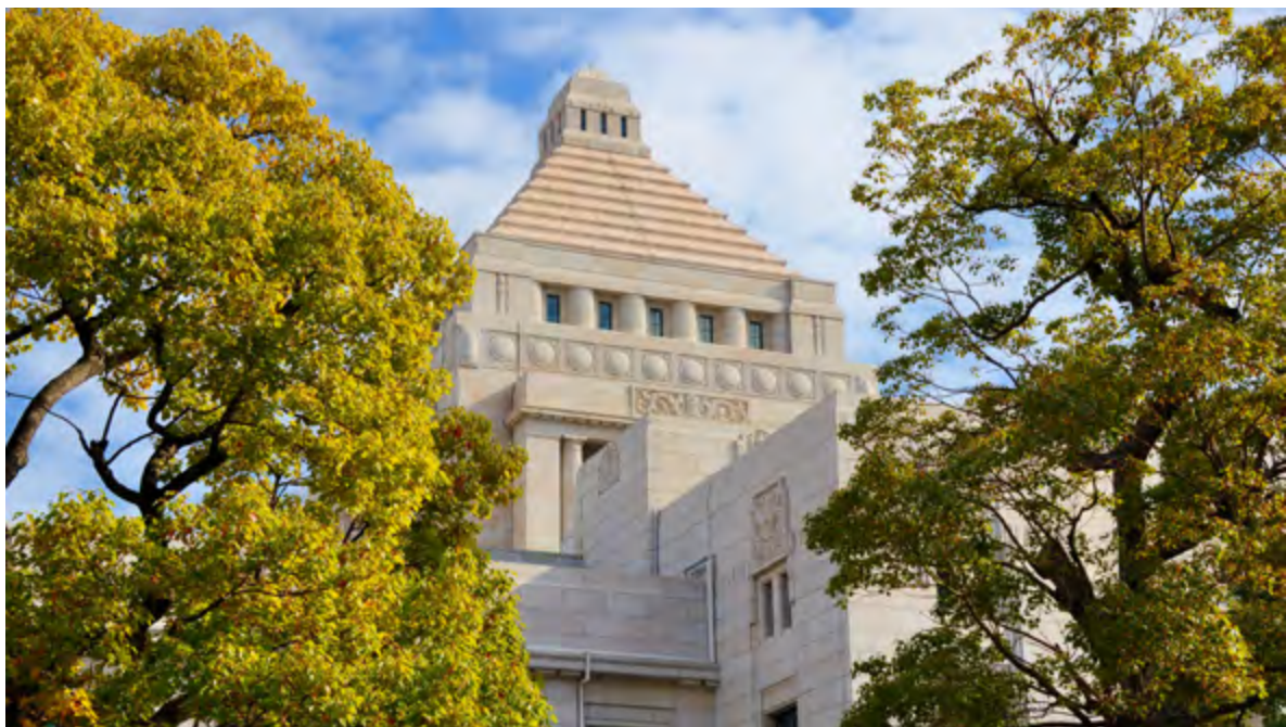
Below: National Diet Building, in Tokyo, Japan.