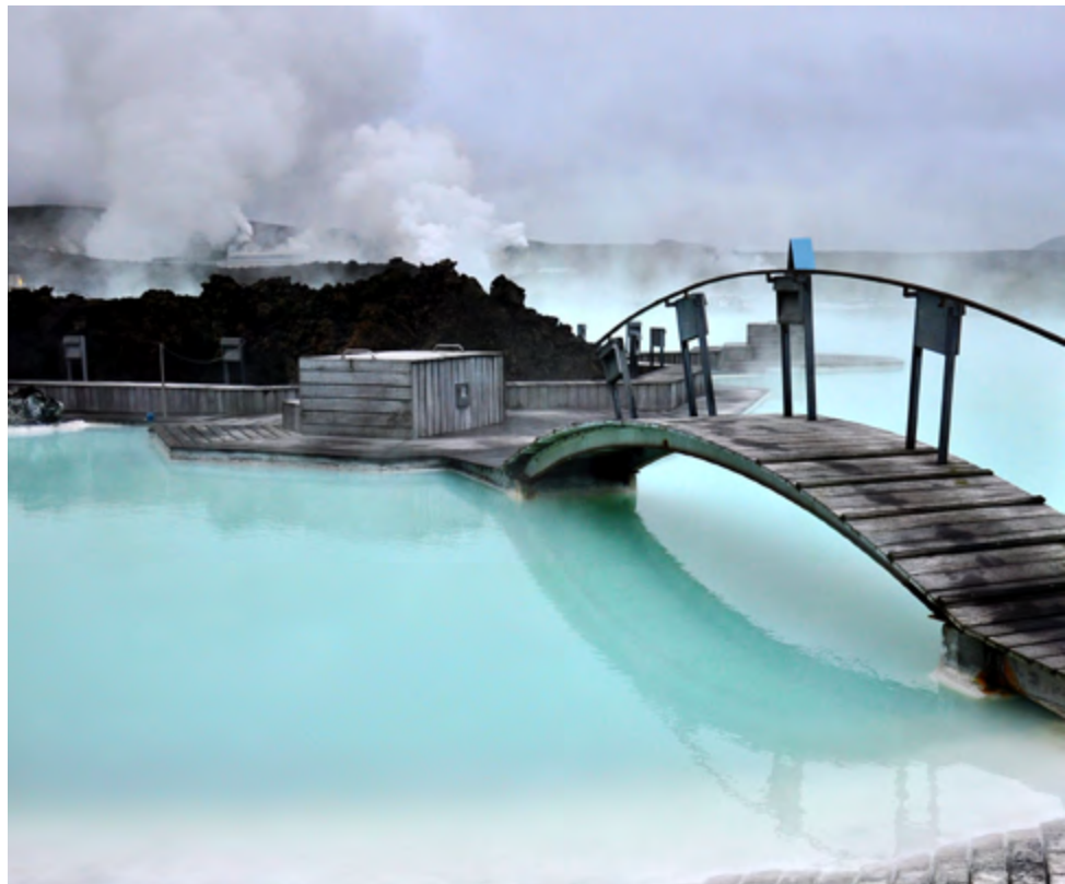
Right: Blue Lagoon, Iceland.