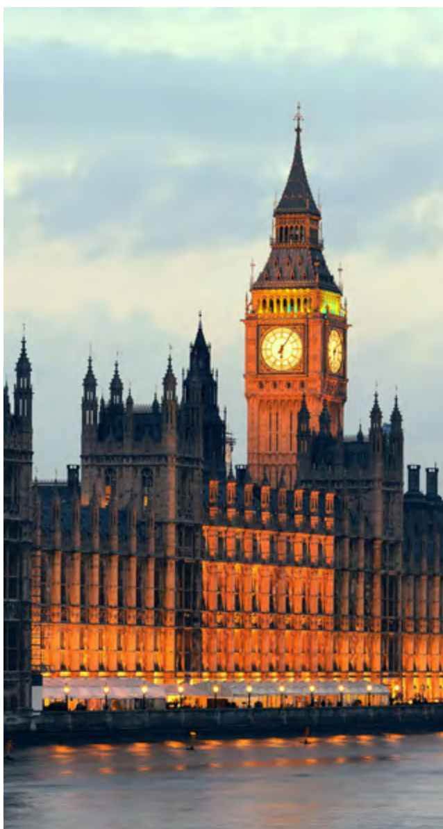
Below: Houses of Parliament in London, UK.

visa issues are also seen to have had an adverse effect on inbound Travel & Tourism flows. A competitive assessment exercise carried out by VisitBritain found that the UK's visa regime puts the destination at a disadvantage compared with its competitors.