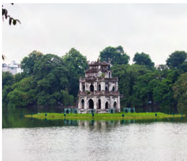
Right: The Turtle Tower in Hanoi, Vietnam.

It remains to be seen whether or not this will continue when/if EU funding is withdrawn.