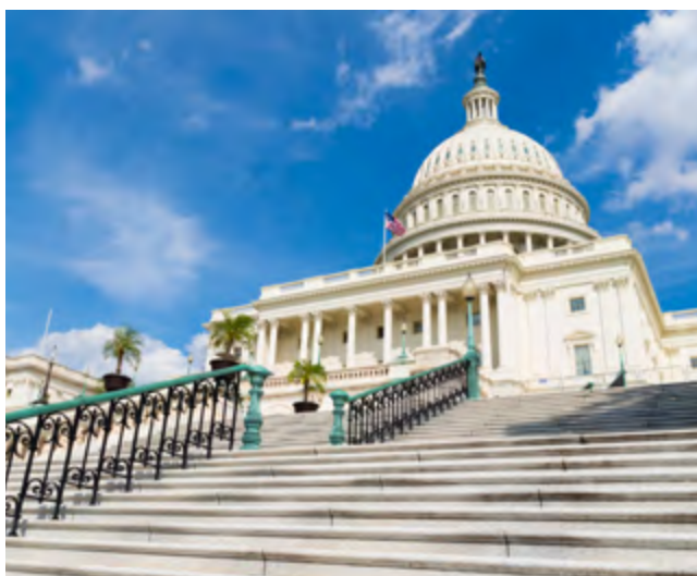
Below: United States Capitol, Washington DC.

The USA's tourism success in recent years is in large part due to the much closer co-operation and collaboration between the public and private sectors, as well as to the US Government's recognition of the important advisory role the tourism industries can play in government policy formulation and implementation. The political leadership from the President and Cabinet has been a tremendous boost for recognising the vital role that Travel and Tourism plays as the leading services export and job generator.