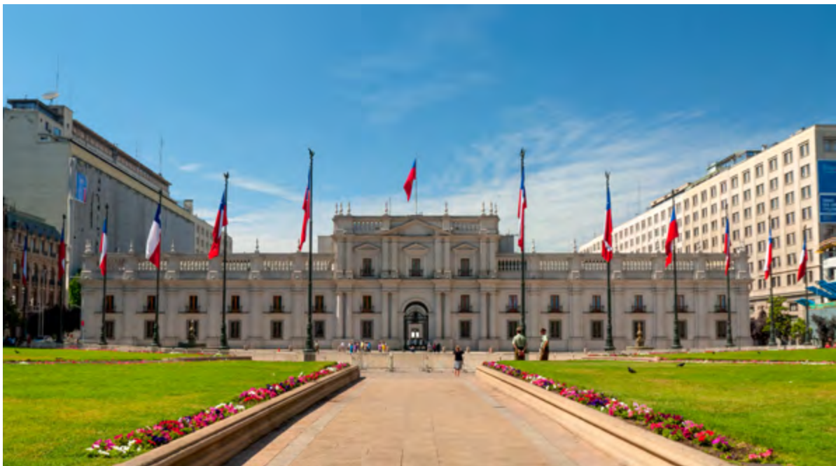
Below: Palacio de la Moneda in Santiago, Chile.