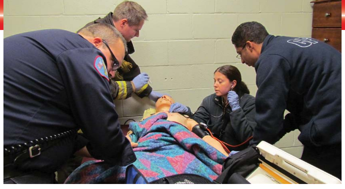
ALS fire and ALS ambulance crews work together to assess a patient—one of the Simulation Training Center's new high-fidelity manikins.

arrest runs prior to the ICCA course with runs handled after the launch of the class. This research focuses on comparing the amount of time CFD engine companies spend on scene, proper defibrillation technique (timing and number of shocks delivered), time spent off the chest of the patient, use of their Lifepak monitor/defibrillator and the patient's ultimate outcome. The data will be compiled and presented in a future paper.