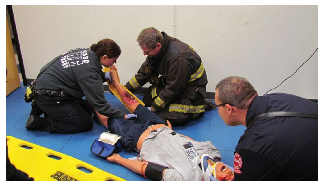
Firefighter and paramedics work together to assess and treat a simulated trauma victim.

The CFD STC has started preliminary data collection through the SafetyPAD EMS information management system to compare cardiac