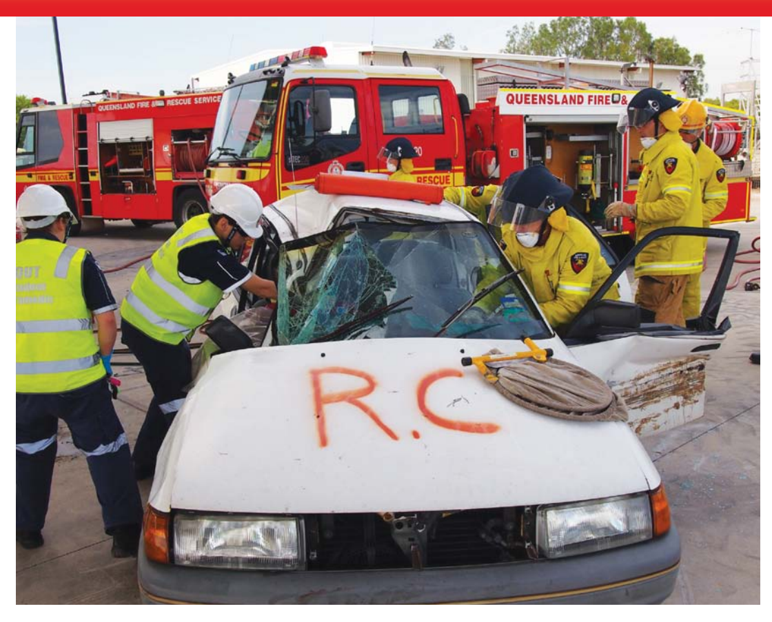
Firefighter and paramedics work together to assess and treat a simulated trauma victim.

dency to be tutor lead and constructed around a practical/ laboratory type session.