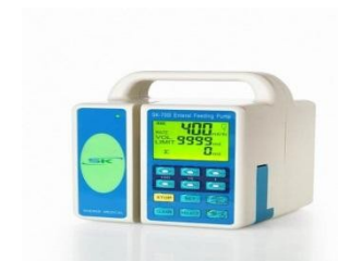
Enteral feeding pump