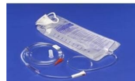
Tubing for feeding pump