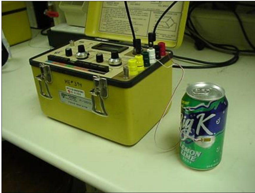
Figure 1. Title of figure in 11 point type beneath the illustration [Knost, 2004]. Feel free to add a sentence or two to point out important features.