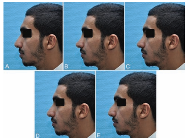
Figure 2 - A profile photograph of a male with 5 different nasal dorsal levels: A) convex within 2 mm; B) concave >2 mm; C) concave within 2 mm; D) straight; E) convex >2 mm.

Disclosure. Author have no conflict of interests, and the work was not supported or funded by any drug company.