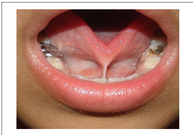
Figure 2. Ankyloglossia image (Noura).

learning new concepts. As Ozuru et al. (2009) state, “students’ difficulty in learning new concepts can be alleviated to some extent by making text more cohesive which makes readers less dependent on pre-existing knowledge” (p. 239).