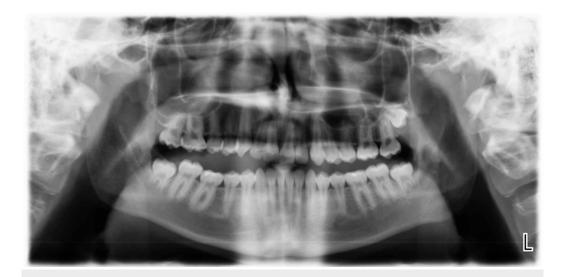
FIGURE 1: Panoramic radiograph

A 17-year-old male patient attended the oral and maxillofacial surgery clinic in King Saud University requesting extraction of all third molars. The patient's medical history was unremarkable; he was a non-smoker and revealed no history of previous facial trauma or surgery. There was neither pain nor swelling of the buccal and lingual sulci of the mandible and no cervical lymphadenopathy. Initial dental examination revealed a minimally restored permanent dentition with good oral hygiene. A panoramic radiograph showed that all third molars were present and impacted except on the upper right side where the tooth was missing, with the lower third molars in close proximity to the inferior alveolar canals (Figure 1). The radiograph was otherwise unremarkable with no signs of pathology or abnormality.