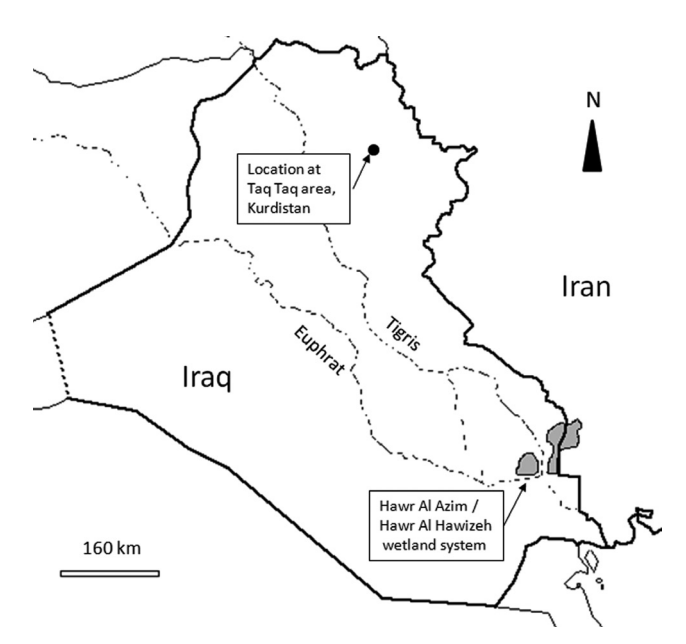
Fig. 1. Location of the Hawr Al Azim/Hawr Al Hawizeh wetland system on both sides of the Iraqi-Iranian border and the location of the River Nal Zab al Saghir, Taq Taq area in Kurdistan.

Skins from two otters were collected in the wild in November 2008. The first otter was found dead at Taq Taq area (on the River Nal Zab al Saghir) in Kurdistan, northern Iraq (N 35° 53′, E 44° 37′; Fig. 1). The second was purchased from a hunter who killed the animal on the Iraqi side of the Hawizeh Marshes (N 31° 37′, E 47° 43′; Fig. 1). Based on morphological